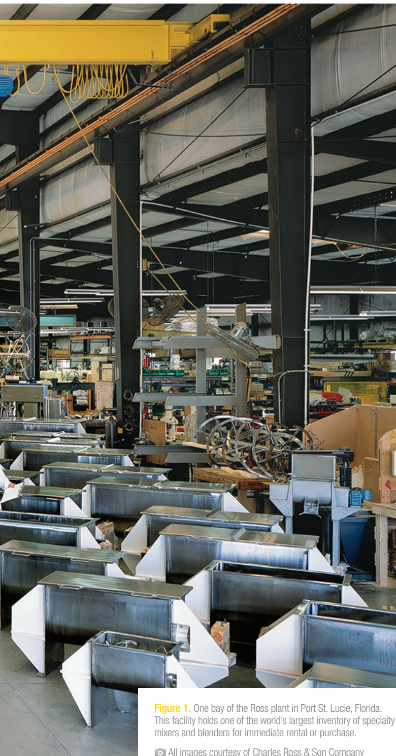
Figure 1. One bay of the Ross plant in Port St. Lucie, Florida. This facility holds one of the world's largest inventory of specialty mixers and blenders for immediate rental or purchase.