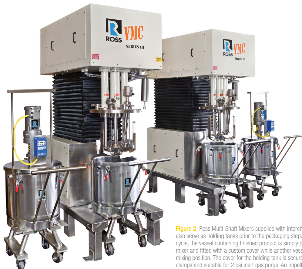
Figure 2. Ross Multi-Shaft Mixers supplied with interchangeable vessels that also serve as holding tanks prior to the packaging step. After each mixing cycle, the vessel containing finished product is simply pulled from under the mixer and fitted with a custom cover while another vessel is rolled into the mixing position. The cover for the holding tank is secured via quick-acting clamps and suitable for 2 psi inert gas purge. An impeller agitator mounted to a tri-clamp port on the cover prevents any settling or separation.