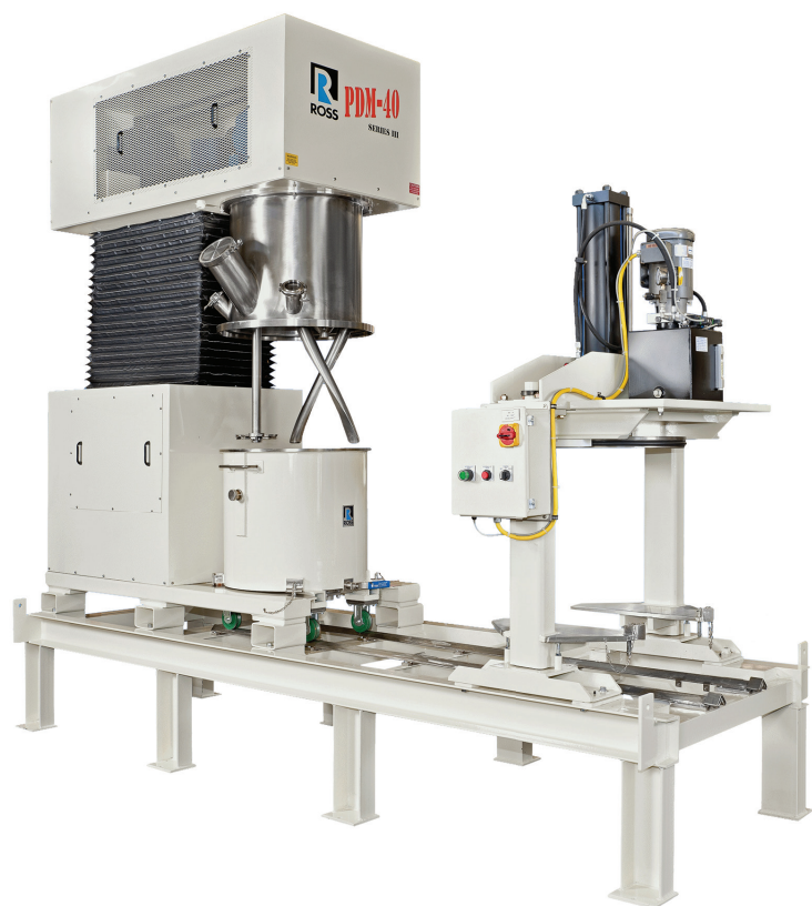
Figure 3. Planetary disperser and discharge system on a common raised base. V tracks allow for easy transport of the vessel between the mixer to the discharge station. During the discharge process, the platen is lowered hydraulically into the vessel and pushes down on the batch. Sidewall surfaces are virtually wiped clean by an O-ring around the platen. Product is forced out through a valve on the bottom of the vessel and into 5-gallon pails positioned right under the base.

“Automation offers improved safety to mixing processes by limiting operator exposure to hazardous chemicals and extreme temperatures.”